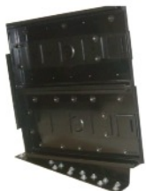
Vehicle Fixing Kits for mk3 or Laptop Safe.

Depending on the Vehicle make, model, year and type and whether the Vehicle Fixing Kit is installed in the boot, under the front seat, in the back of a Hatch Back, in the rear of a 4 Wheel Drive or Station Wagon we have a Vehicle Fixing Kit that can be installed in each location.