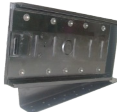
Vehicle Fixing Kits for an mk2.