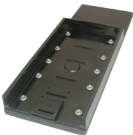
Marine Ply Vehicle Fixing Kit secured under the parcel shelf.