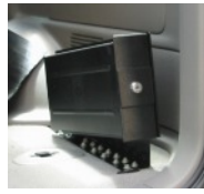
mk2 Steel Bracket Vehicle Fixing Kit secured in the rear of a Toyota Landcruiser.

by first installing a Vehicle Fixing Kit in the Vehicle. Since 1993 we have designed a Vehicle Fixing Kit for practically every make of Vehicle and if we have not previously designed one for your Vehicle we will design one for you FREE OF CHARGE . Just tell us the make, model, year and type.